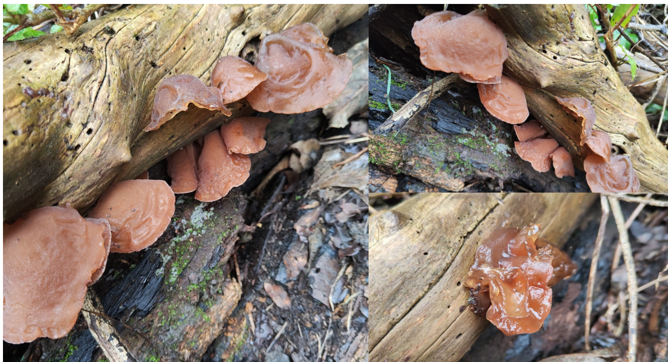
Jelly Ear fungus—at Railway Fields

Wear suitable outdoor clothing and sturdy footwear. Bring a packed lunch.