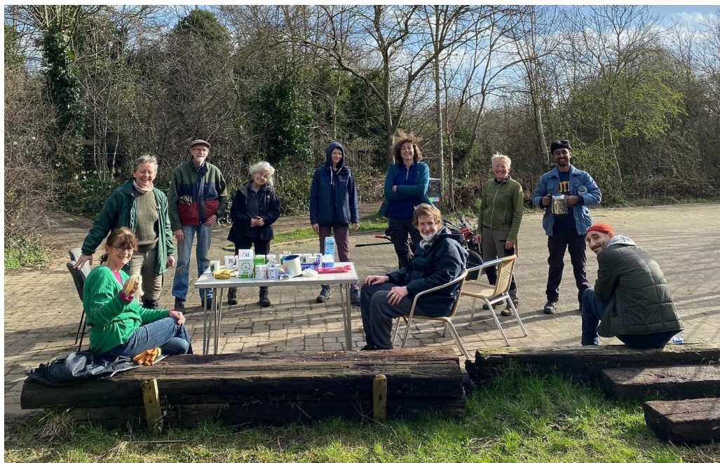
Volunteers enjoying tea and biscuits at The Paddock N17 . Cabins, toilets, drinking water, kettle, fridge and more are now available on site! Come along on Wednesdays and Fridays to check it out.

Wear suitable outdoor clothing and sturdy footwear. Bring a packed lunch.